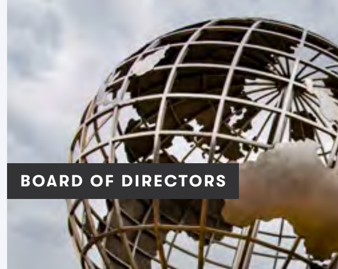
BOARD OF DIRECTORS

Who we are makes us what we are. We are part of a global family of people who are wildly passionate about helping people live better, healthier lives.