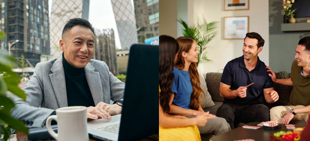
AMWAY BUSINESS OWNERS